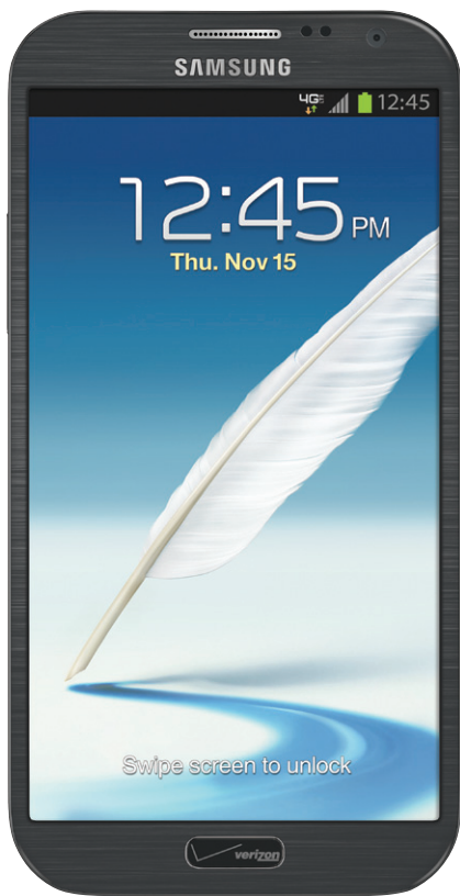
Samsung GALAXY NOTE II

Verizon Wireless is pleased to announce an operating system update to Android 4.4.2 (KitKat) that will improve the performance of your Samsung Galaxy Note II smartphone.